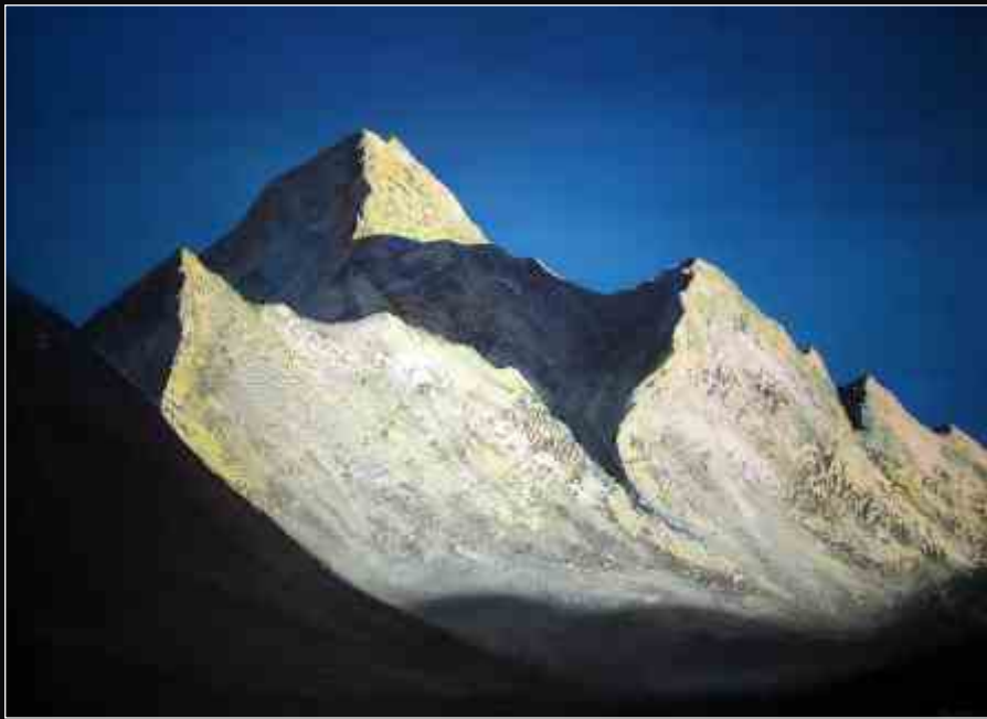
Himalyas In Evening Light